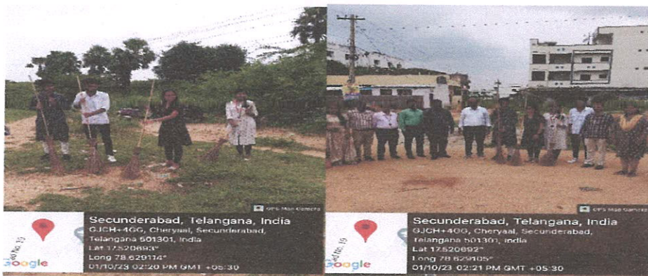
Swachh Bharat at cheeryal village

Geethanjali College of Pharmacy-NSS unit conducted Swachh Bharat to instilling awareness and feeling of pride among citizens to keep their surroundings clean and waste free on 1/10/2023 in cheeryal village. Students of B. Pharmacy III year actively participated and our beloved Principal and teaching and non-teaching faculty actively participated and made the program grand success.